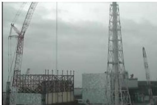
Fukushima-Daiichi Nuclear Power Plant

Reference: Tokyo Electric Power Company Holdings, Incorporated